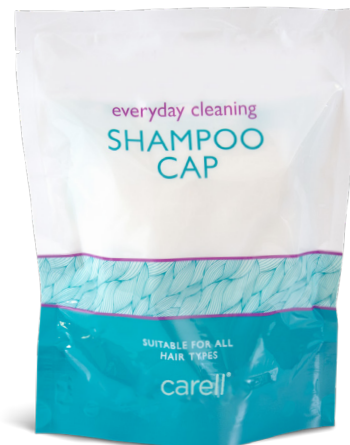
Bedbath Shampoo Cap (Pack of 1 – PRSHMC1)

Our revolutionary cap is designed to be used on dry hair when traditional bathing is not an option. By massaging the cap contents into the scalp it removes oil, grease and dirt leaving your hair feeling clean, soft and healthy.