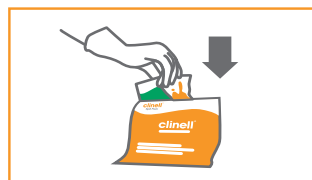
10. Place the soiled wipe and empty sachet back into the pack.