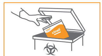
12. Dispose of in the appropriate waste stream.