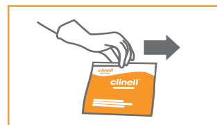
11. If required repeat steps 8-10 with the second wipe and re-seal.