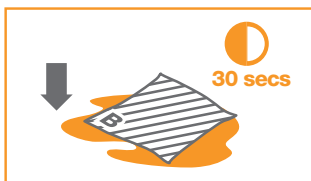
5. Place the active side (A) face down onto the spill. Leave to absorb for 30 secs.