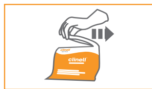
2. Tear the pack open.