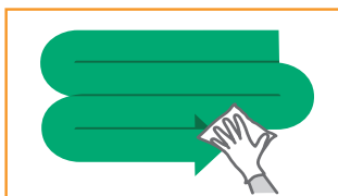
9. Clean the spill area in an 'S' shaped motion, from clean to dirty.