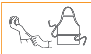
1. Wear appropriate PPE.

Clinell Spill Wipes were created to make the entire process of dealing with body fluid spills easier and safer. They increase compliance in this necessary, yet often neglected, infection control procedure in a cost effective manner.