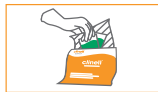
3. Remove the wipes.