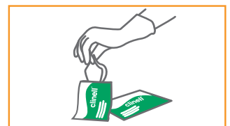
8. Remove a disinfectant wipe from the sachet.