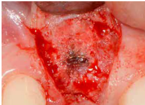
New bone at 12 weeks