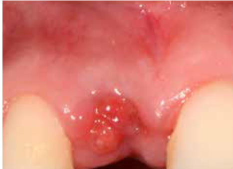
3 weeks healing post-extraction